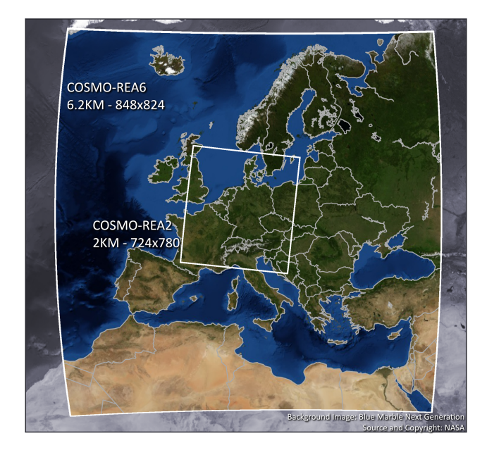
Figure 1. Model domains of COSMO-REA6 and COSMO-REA2 (Land Cover Map: Blue Marble Next Generation, © NASA).

The Universities of Bonn and Cologne were successful with their joint proposal on the priority research area "Climate Monitoring and Diagnostics". The group started to develop the first regional reanalysis based on DWD's NWP model systems in 2011 in close cooperation with DWD. After initial discussions, two configurations were implemented within the first phase of HErZ: A regional reanalysis for Europe covering the European CORDEX-domain with a 6.2 km horizontal resolution (COSMO-REA6; Bollmeyer et al., 2015), and a 2 km reanalysis for Central Europe (COSMO-REA2; Wahl et al., 2017). The European CORDEX domain (CoOrdinated Regional Downscaling Experiment; Kotlarski et al., 2014) was chosen for the former reanalysis to provide a dataset that is consistent with the configuration used in the regional climate modelling community. The COSMO-REA6 system was handed over to DWD in 2015 and regularly updated afterwards. Recently the updates came to a halt with the end of the availability of ERA-Interim (Dee et al., 2011),